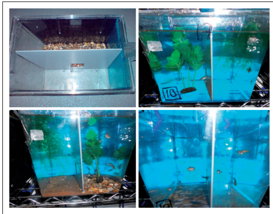
Figure 1. Design of the experimental tanks with examples of cues presented in the preference tests. Clockwise from top left: 1. Experimental tank with gravel substrate versus a barren cue. 2. Both plant types as competing cues. 3. Gravel substrate image versus barren. 4. Substrate/plant combinations in direct comparison with sand and floating plant on the left side and gravel and submerged plant on the right.

Enrichments. The structural enrichment chosen was based upon the biotic features of zebrafish habitat. 11,14 Two different substrates, sand and gravel, and two types of artificial plants were chosen (Fish & Fins, Hailsham, East Sussex, UK). One plant type ('submerged plant') simulated broad-leaved bright green submerged and rooted aquatic vegetation (such as Cryptocoryne ) with a black resin root base, while the other ('overhanging plant', green Supa Fern ® ) had no root base, resembling overhanging ferns or similar unrooted fine-leaved vegetation to provide overhead cover. The two grades of substrate offered were, depending on grain size, classed as 'sand' (<1 mm) and 'gravel' (>5 mm). Aside from substrate and plants as naturalistic enrichment elements, the study investigated air stones, which as behavioural engineering devices create flow and turbulence by bubbling air through the tank and may promote activity. 15 In order to minimize disturbance the air flow was set at a low rate, with a constant flow of bubbles but no