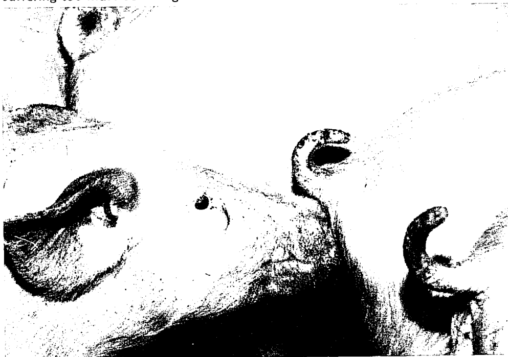
Figure 2 Anal massage of a fattening pig kept under poor housing conditions.

As early as 1968 M. Fox wrote a book entitled Abnormal Behavior in Animals . In spite of this valuable and highly respected work we still know very little of the relevance of abnormal behavior to animal welfare. Animal welfare means helping suffering animals. But we can only help them if we know exactly when they are suffering. Abnormal behavior is a key to recognizing suffering in animals. We still have a long way to go before we can more closely describe and understand the significance of all abnormal behavior. We have still a longer way to go to convince producers and legislators that conditions of animal husbandry leading to immaterial suffering too must be changed.