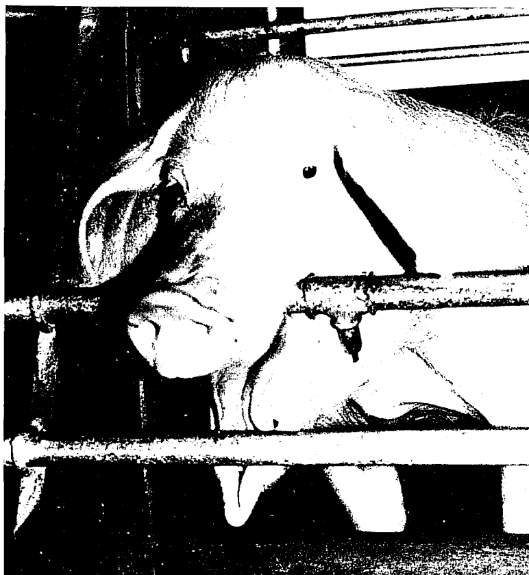
Figure 1 Sow biting the bar of her box stall.

Abnormal behavior appears frequently in two areas: feeding and locomotion. Search for fodder, fodder intake, mastication and swallowing of food all belong to feeding behavior. Abnormality can appear in each of these stages, be it empty chewing or bar-biting in sows (Fig. 1), cannibalism in fattening pigs, tongue rolling in cattle, sucking wind in horses or feather pecking in poultry. All these behaviors show that the animal is frustrated. Similar to the above are "weaving" and mouth movements which appear in numerous species. These are stereotypies of locomotion in animals that want to move forward but are prevented by confinement from doing so.