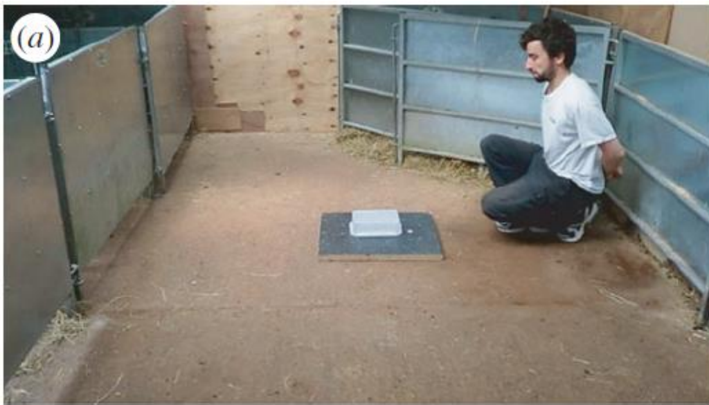
Figure 1. Experimenter 1 in the test arena demonstrating the group conditions: (a) FORWARD condition and (b) BACK condition; Experimenter 2 (not in the image) was positioned on the right side of the camera in both test conditions.

experimenter [7]. However, both dogs and horses have been domesticated to work closely with humans, which may explain their higher inclination to rely on human information. To date, no research on animals that have been domesticated for food and related products, rather than companionship, has been conducted to investigate whether these enhanced communication skills underlie a broader effect of domestication. To answer this question, we investigated goat behaviour in an 'unsolvable problem' task, in which subjects that were highly habituated to human presence and handling were either confronted with a forward-facing or away-facing human experimenter.