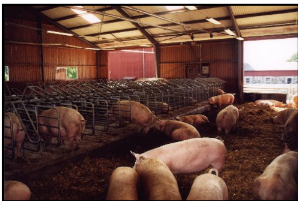
Swedish deep-bedded gestation housing

The Swedish system for group housing gestating sows on deep straw with individual feeding stalls—one for each sow in the group—is economically competitive on modest-sized farms (100 to 500 sows) and has generated interest in other countries. The system was developed by a farmer near Stockholm in the 1970s and quickly spread to other farms in the country as farmers found that it was the best way to feed and maintain healthy sows. 44,45 In this system, sows are housed indoors in groups on a deep bed of straw. The sows are fed individually in free-stalls and this allows the producer to adjust the diet of each sow individually, reduces fighting, and eases management for administering vaccinations, sorting, or performing artificial insemination. As compared to typical confinement operations, sow