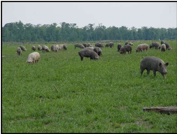
Gestating sows on pasture

A renewed interest in outdoor pig production has expanded internationally including in North America, parts of Europe, and in South Africa. Outdoor pig farms can range considerably in size, from very small (10 sows or less) to very large farms with 10,000 sows. 52 In pasture-based pig production, sows gestate and sometimes give birth outdoors in small huts. The huts are bedded with straw and are portable by tractor so they can be rotated to fresh pasture. Huts may be insulated for winter farrowing 53 or farrowing may be seasonal. 54 Electric, low-cost fences are used to contain the pigs, and the stocking density may be 7-15 sows per acre. These farms often diversify by including a crop production enterprise in addition to the pigs. The freedom of movement and natural environment offer animal welfare benefits, but these operations also provide employment in rural areas, distribute the farmer's financial risk, and support the local economy. The system is sustainable, as crops can be used to feed pigs and pig manure can be utilized to fertilize cropland in a small enough quantity that the land can absorb it. 55 Outdoor pig production is becoming more popular in the United States, especially in geographical areas that are not traditionally areas of highly concentrated swine production, such as Oklahoma and Colorado. 56