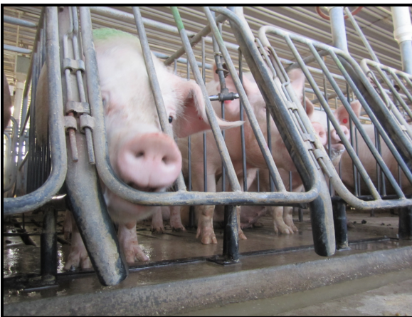
Sows in gestation crates.

Gestation crates are individual stalls with metal bars and concrete floors that confine pregnant pigs in the commercial pork production industry. Gestation crates measure 0.6-0.7 m (2.0-2.3 ft) by 2.0-2.1 m (6.6-6.9 ft), only slightly larger than the animals themselves, and restrict movement so severely that the sows are unable to turn around. 1 In typical pig production facilities, gestation crates are placed side by side in long rows. They are primarily used on large-scale industrialized pig production operations, where thousands of pigs are produced annually in warehouse-like buildings.