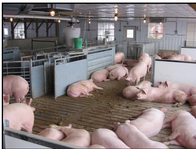
Group housing with Electronic Sow Feeding (ESF) system (left).