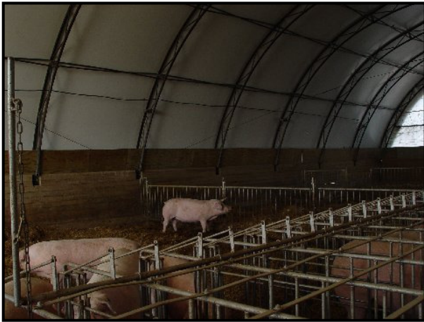
Deep bedded hoop barn, University of Minnesota at Morris

The capital costs of hoop barns are much less than conventional confinement facilities. As part of a long-term research project on alternative pig production facilities conducted at Iowa State University, it was determined that hoop barns can be built for 30% less than the cost of a conventional confinement facility with gestation crates.