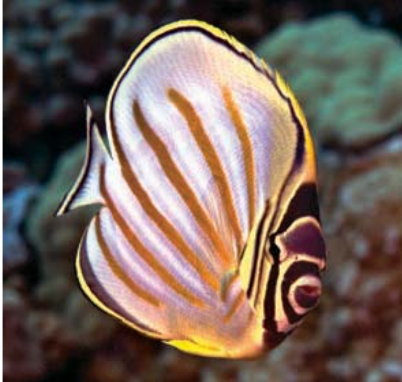
ORNATE BUTTERFLYFISH Even aquarists agree these fish, who mate for life, should be left in the sea, as they feed only on live coral polyps. Yet they're taken by collectors. At right, goldring surgeonfish swarm a turtle for a meal—a scene that could only happen in the wild.

reports Bob Fenner, a retired collector who has written about the trade. A big contributor to the high mortality rate is the cyanide commonly used to stun fish for easy capture.