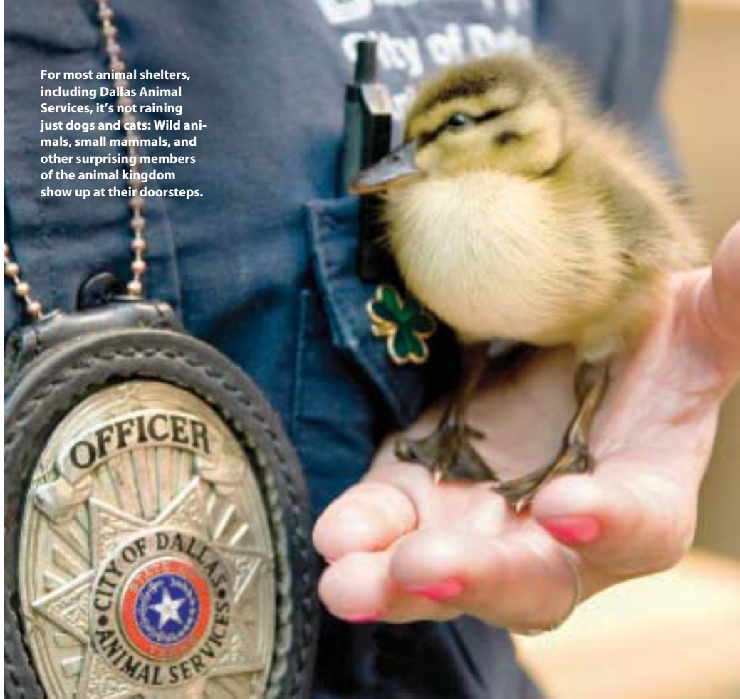
For most animal shelters, including Dallas Animal Services, it's not raining just dogs and cats: Wild animals, small mammals, and other surprising members of the animal kingdom show up at their doorsteps.