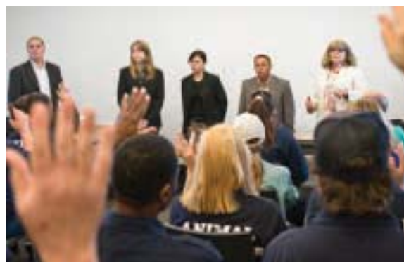
On their first day of meetings with staff and community members, the HSUS team keeps in mind the ultimate goal: to help local organizations build progressive programs that will address the root causes of animal homelessness.

It's a tenet in the profession that animal shelters reflect the communities they serve—particularly the prevailing attitudes and practices related to animals. In some locales, the passion many people feel for helping homeless animals eventually leads to modern, progressive shelters buoyed by government support and committed donors and volunteers. But that same passion can also manifest in public suspicion about a shelter's operations. Sometimes,