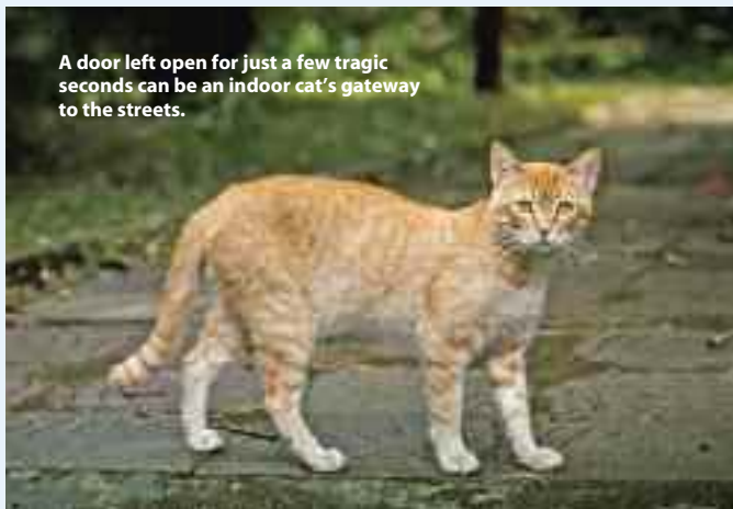
A door left open for just a few tragic seconds can be an indoor cat's gateway to the streets.

Subject to human whims and errors, the system can break down at several points. Many shelters now have universal scanners that can read microchips of different frequencies, but the serial numbers on the chips are often still untraceable—either because they have never been registered in the first place or because pet owners fail to update