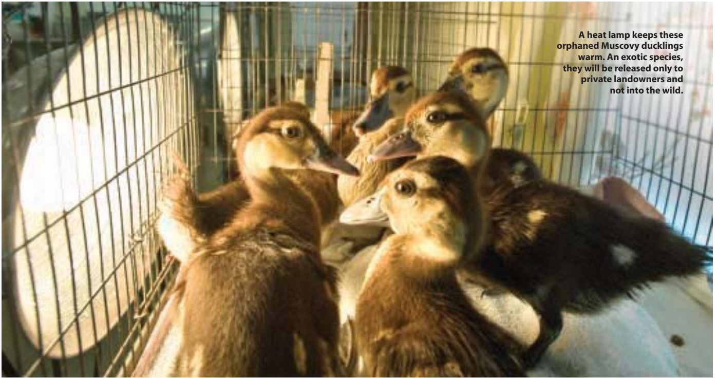
A heat lamp keeps these orphaned Muscovy ducklings warm. An exotic species, they will be released only to private landowners and not into the wild.

Finding suitable homes for nonnative species can be equally daunting. For example, six days after Harsch wrangled the hook from that Muscovy duck's throat, the bird had fully recovered. But since these resilient and prolific breeders aren't native to Florida, it's unlawful to release them; instead, a center adoption specialist must find them homes on private property, whether in backyard habitats or on the retention ponds of willing gated communities. "We want to give them adequate care," Harsch says, "but what will you do with them afterwards?" Ditto the interloping peafowl and nonnative par-