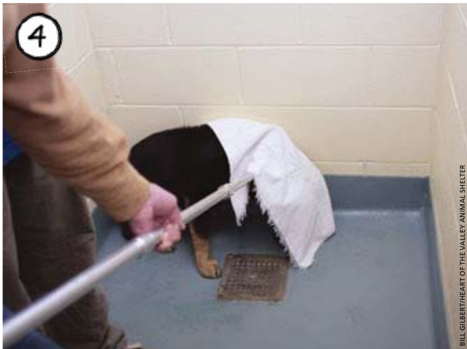
A towel on the dog's head can comfort her, as well as make things safer for the handler.

move toward the dog, a few steps at a time, then stop and settle. Each time, move a few steps, then settle and allow the dog to recognize that she's still safe as you move closer. This—moving into the animal and moving with the animal at the same time, without scaring her—is the most difficult part to learn.