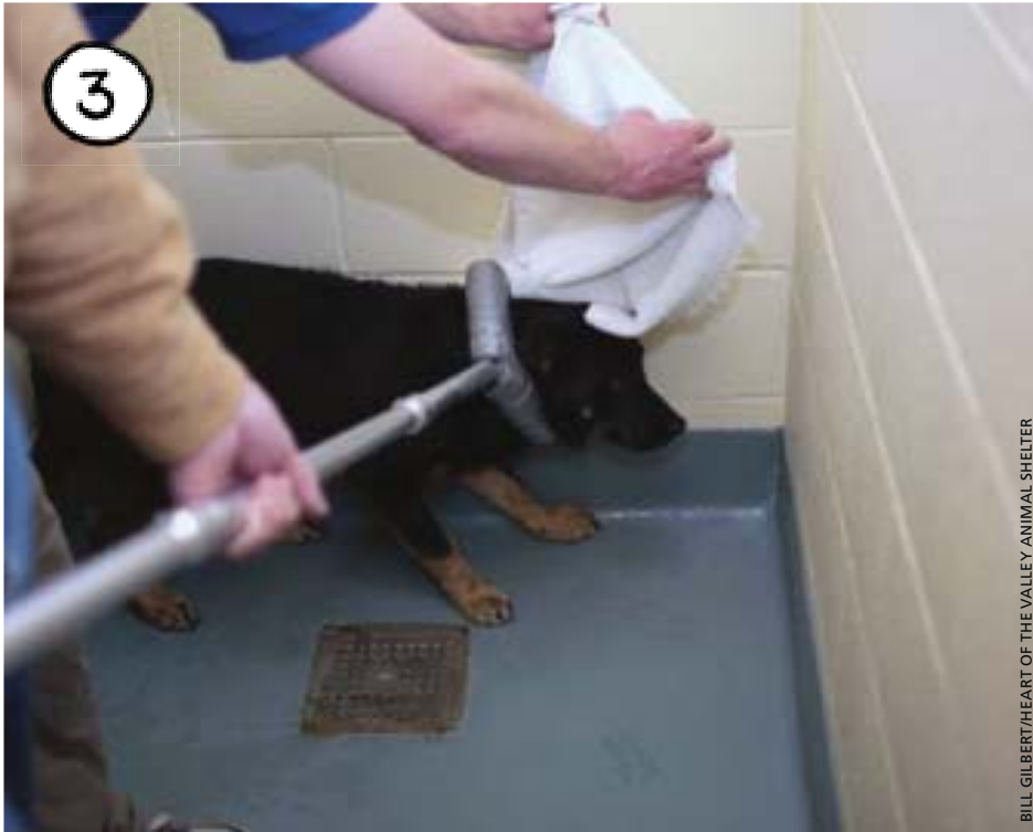
BILL GILBERT/HEART OF THE VALLEY ANIMAL SHELTER