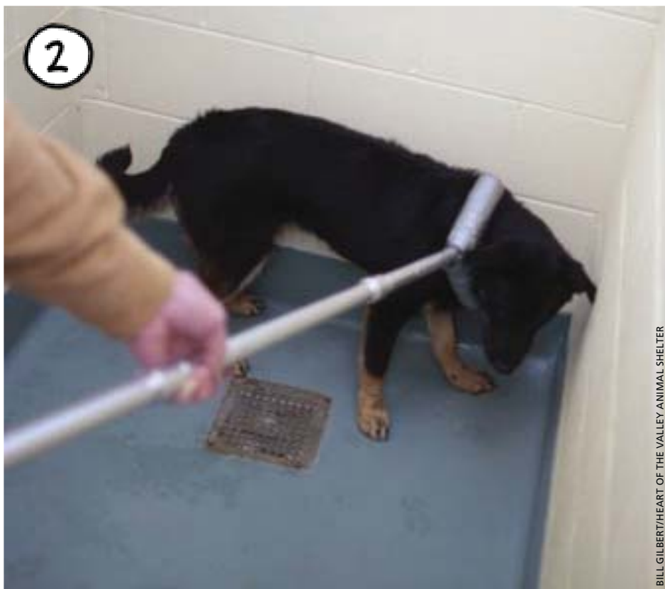
BILL GILBERT/HEART OF THE VALLEY ANIMAL SHELTER