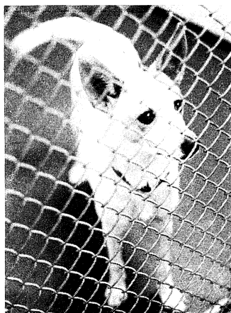
Animals in quarantine must be safely and humanely confined according to Texas state law.

After your shelter is inspected, the law allows up to one year to make the needed corrections. If these are not done by the local government, the law requires the shelter to cease operation until acceptable standards have been established.