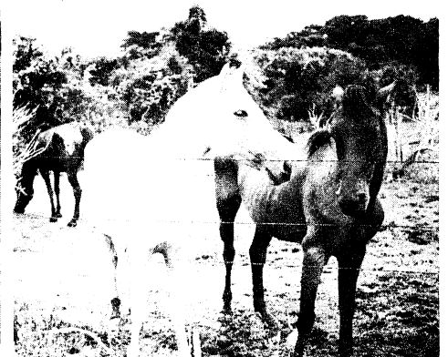
Three cases of horse starvation investigated by The HSUS Gulf States Office.