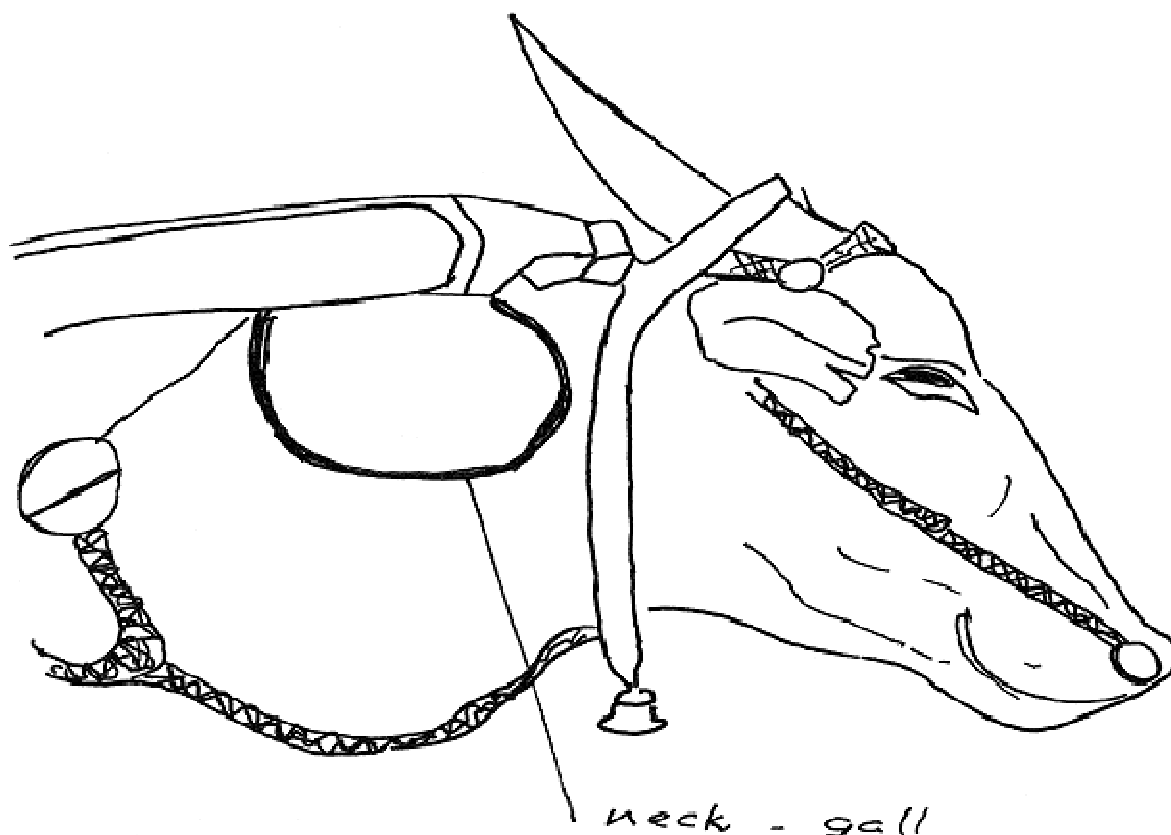
Figure 1. Neck-gall due to yoke rub (Ramaswamy, 1998).

distances to and from dipping areas and during these journeys animals are given water and allowed to rest. Non-dipping of cattle due to these limitations results in high tick loads that cause tick damages to parts, such as udders and scrotums and tick-borne diseases such as heart water and red water (Muchenje et al., 2008a). In such cases, it is advisable to use indigenous cattle breeds that are tolerant to ticks and less susceptible to tick-borne diseases.