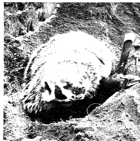
With one paw caught in a steel jaw trap, this badger dug frantically into the ground until he had made a hole the size of a pond. To have accomplished such a feat, he must have been in the trap for many days.

Many trappers claim their work is necessary to reduce surplus populations of certain wild animal species and to