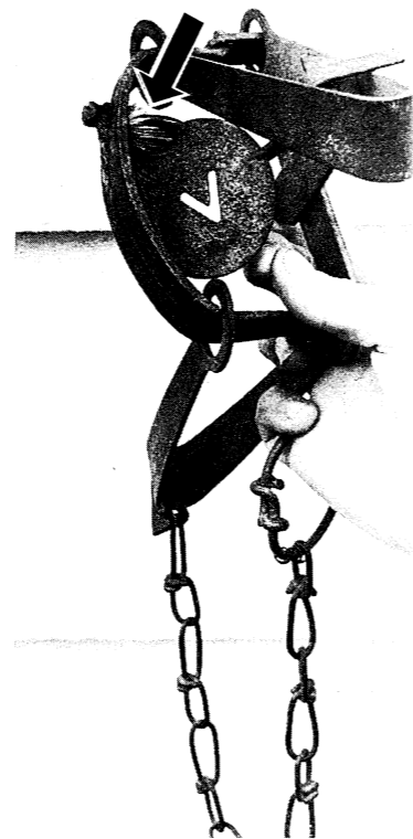
An animal left part of his paw (arrow) when he escaped from this leghold trap.

still permit this barbaric method of catching animals. With the opening of new territories in the early 19th century, the steel jaw trap was introduced as an expedient method of obtaining food and building a base for commercial trading. This practice is as unjustified in the 1970s as the use of a torture chamber or a guillotine.