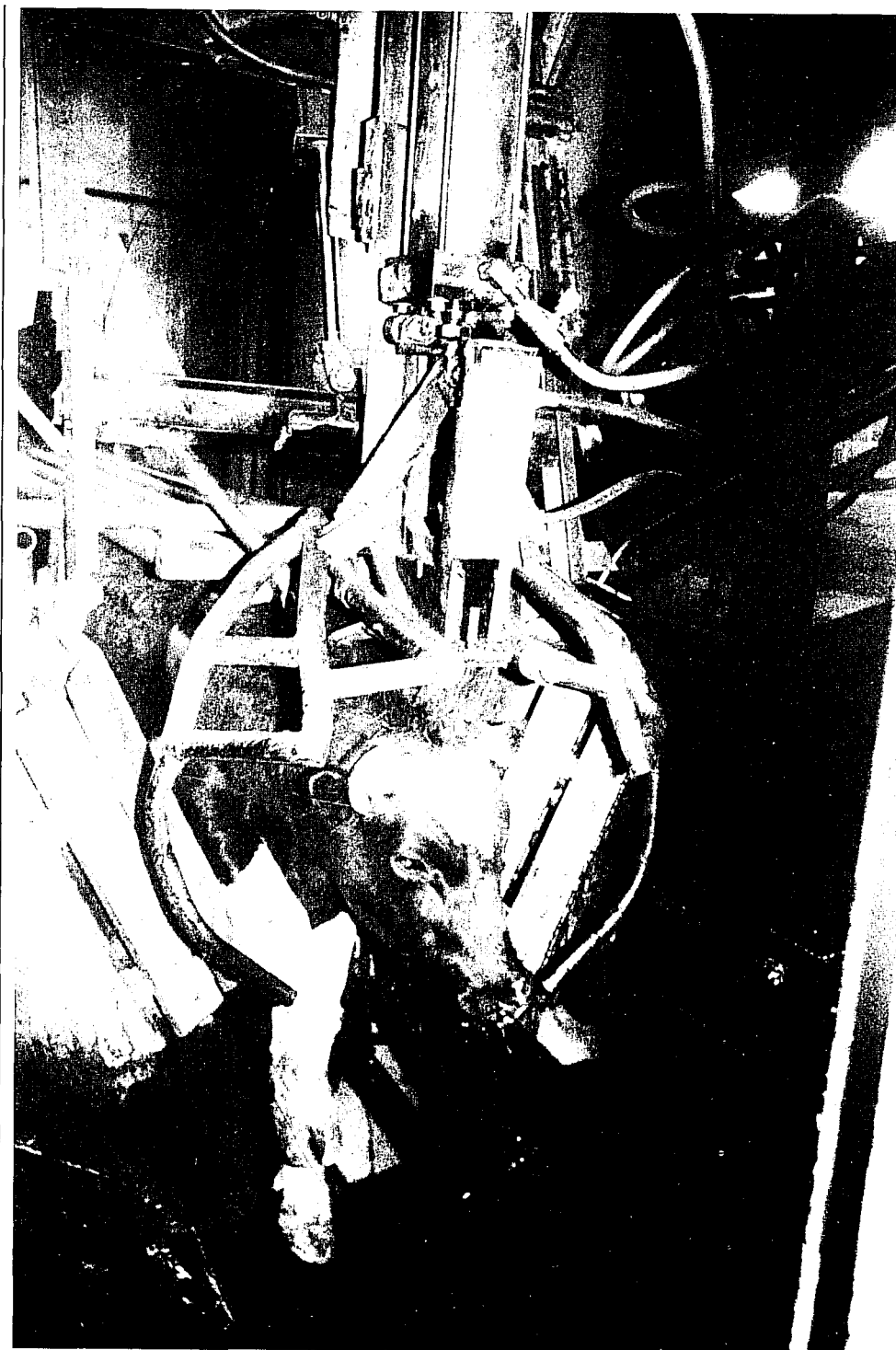
FIGURE 3 — New kosher restrainer system. Head holder on the end of the restrainer-conveyor is ready to catch and lift the animal's head for kosher slaughter.