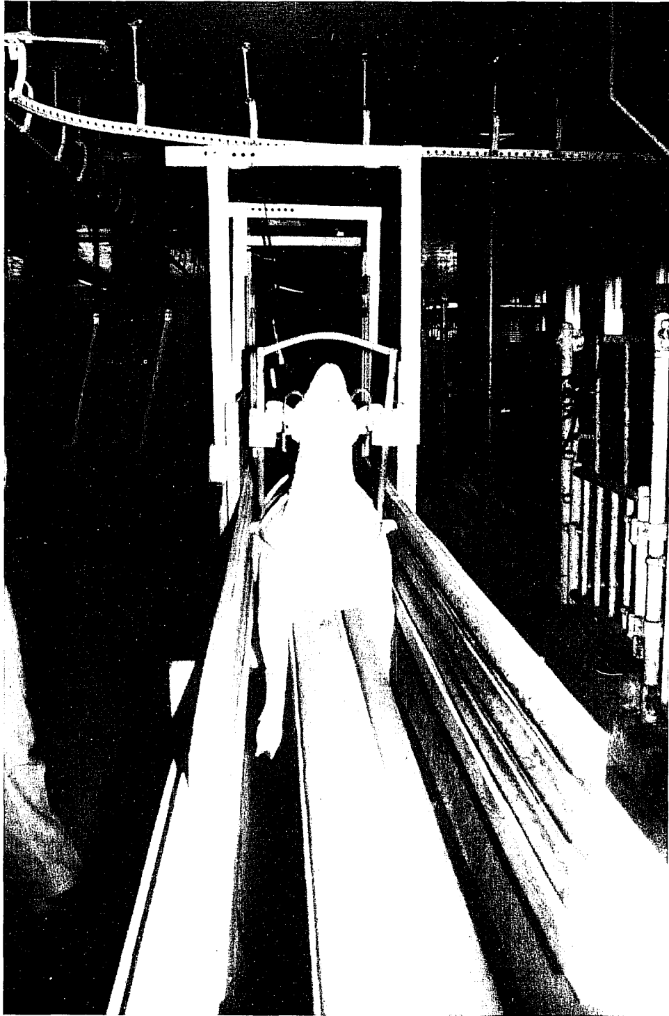
FIGURE 4 — Double rail restrainer: neck stretched and ready for shochet.