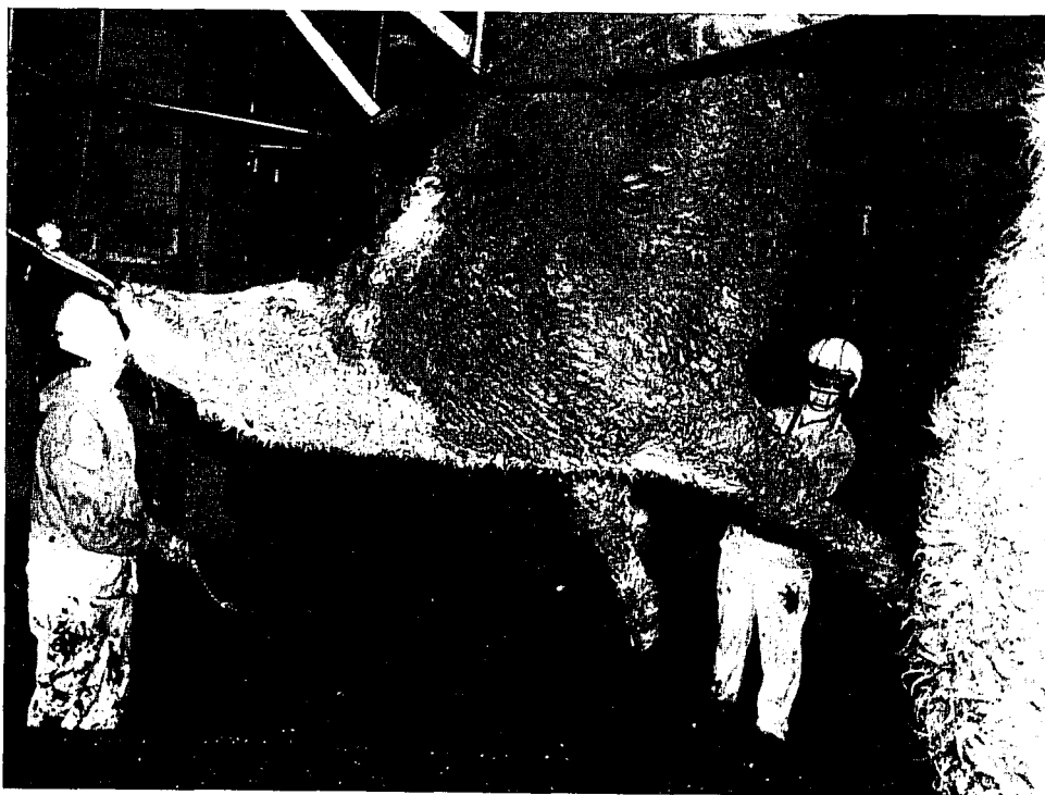
FIGURE 2 — Animal which has been shackled and hoisted in preparation for kosher slaughter. The animal's neck is stretched with a tong placed in the nose.

The procedure causes tissue damage to the hind leg, and the jerking of the limbs of live animals would thus seem to violate the principles expressed in some passages of the Talmud and Bible. Any type of injury to the animal prior to