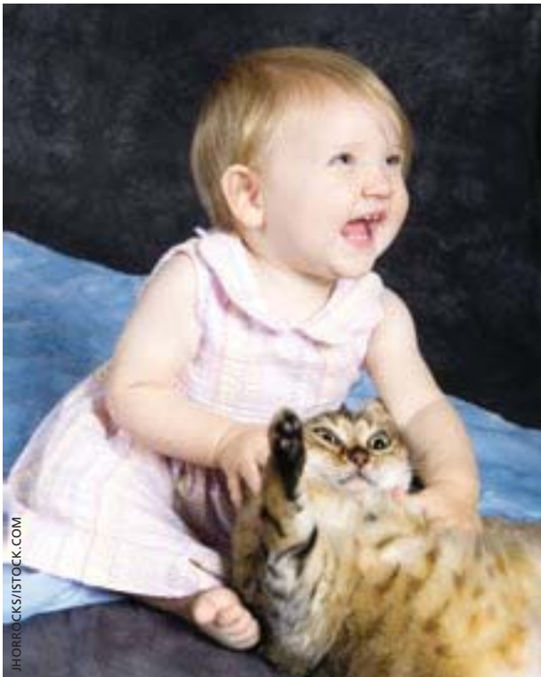
This kitty agrees: Pet-owning parents must provide constant supervision—and when necessary, intervention—for kids interacting with pets.