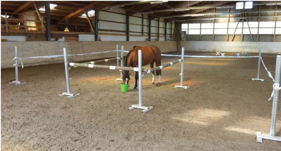
Figure 2. Horse feeding from the rewarded bucket after successfully completing the detour task.