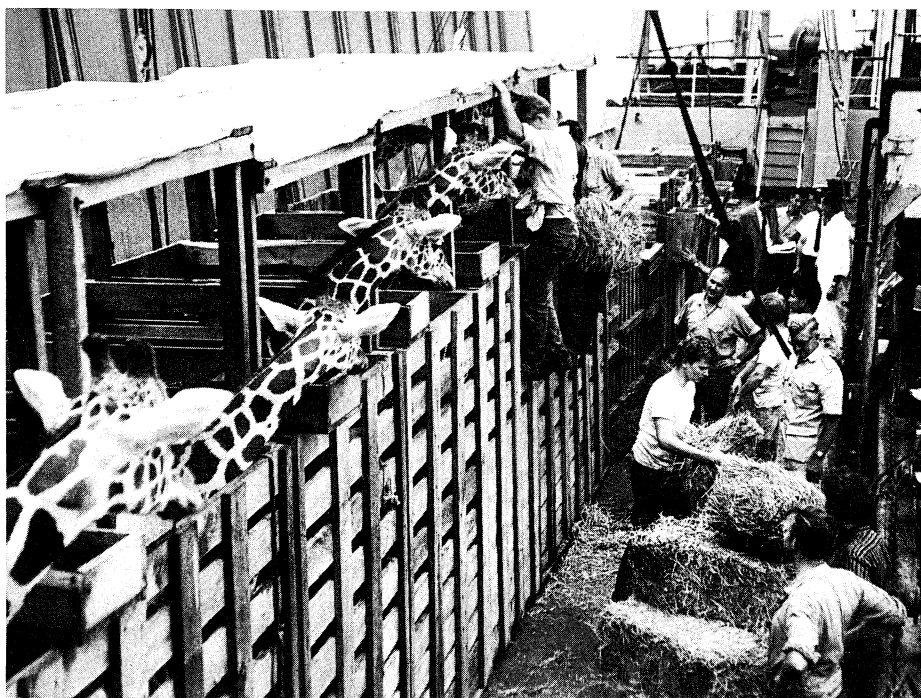
Crew feeds giraffes as Maasloyd docks at New York pier. HSUS agent found animals aboard ship well fed and properly cared for.