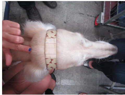
Figure 1. For the current study, each photograph was taken with the camera held horizontally, which allowed measurements to be obtained for each dog's skull length and width. The length was measured from the fingertip to the tip of the nose, and the width was measured from each zygomatic arch, which was displayed by the tape placed around the widest part of the dog's head. doi:10.1371/journal.pone.0080529.g001

The preferred heights for exhibition purposes were drawn from the ANKC breed standards, where available. Where different preferred heights were published for males and females in a given